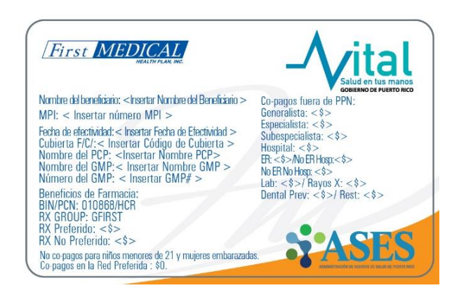
| First MEDICAL | Salud en lus manos continuo del Beneficiario | Salud en lus manos continuo del Beneficiario | Mrl: < Insertar número MPI > | Generalista: < $ | Sepecialista: < $ | Sepecialista: < $ | Sepecialista: < $ | Sepecialista: < $ | Sepecialista: < $ | Sepecialista: < $ | Sepecialista: < $ | Sepecialista: < $ | Sepecialista: < $ | Sepecialista: < $ | Sepecialista: < $ | Sepecialista: < $ | Sepecialista: < $ | Sepecialista: < $ | Sepecialista: < $ | Sepecialista: < $ | Sepecialista: < $ | Sepecialista: < $ | Sepecialista: < $ | Sepecialista: < $ | Sepecialista: < $ | Sepecialista: < $ | Sepecialista: < $ | Sepecialista: < $ | Sepecialista: < $ | Sepecialista: < $ | Sepecialista: < $ | Sepecialista: < $ | Sepecialista: < $ | Sepecialista: < $ | Sepecialista: < $ | Sepecialista: < $ | Sepecialista: < $ | Sepecialista: < $ | Sepecialista: < $ | Sepecialista: < $ | Sepecialista: < $ | Sepecialista: < $ | Sepecialista: < $ | Sepecialista: < $ | Sepecialista: < $ | Sepecialista: < $ | Sepecialista: < $ | Sepecialista: < $ | Sepecialista: < $ | Sepecialista: < $ | Sepecialista: < $ | Sepecialista: < $ | Sepecialista: < $ | Sepecialista: < $ | Sepecialista: < $ | Sepecialista: < $ | Sepecialista: < $ | Sepecialista: < $ | Sepecialista: < $ | Sepecialista: < $ | Sepecialista: < $ | Sepecialista: < $ | Sepecialista: < $ | Sepecialista: < $ | Sepecialista: < $ | Sepecialista: < $ | Sepecialista: < $ | Sepecialista: < $ | Sepecialista: < $ | Sepecialista: < $ | Sepecialista: < $ | Sepecialista: < $ | Sepecialista: < $ | Sepecialista: < $ | Sepecialista: < $ | Sepecialista: < $ | Sepecialista: < $ | Sepecialista: < $ | Sepecialista: < $ | Sepecialista: < $ | Sepecialista: < $ | Sepecialista: < $ | Sepecialista: < $ | Sepecialista: < $ | Sepecialista: < $ | Sepecialista: < $ | Sepecialista: < $ | Sepecialista: < $ | Sepecialista: < $ | Sepecialista: < $ | Sepecialista: < $ | Sepecialista: < $ | Sepecialista: < $ | Sepecialista: < Sepecialista: < Sepecialista: < Sepecialista: < Sepecialista: < Sepecialista: < Sepecial

All Enrollees are issued an Identification Card. This ID Card must be used to receive covered services. Below you will find a sample of the FMHP Enrollee ID Card that must be presented by the Enrollee at the time of service.