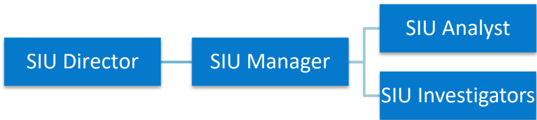
Figure 1. Special Investigations Unit Structure.

The SIU provides analyses and investigations to address fraud, waste, and abuse at all levels, to deter unnecessary costs and to recoup funds for services that are not medically necessary and/or do not meet professionally recognized standards of care.